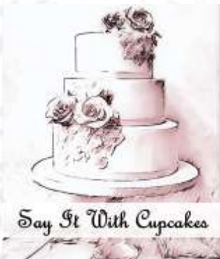
Say It With Cupcakes

We have chosen local specialist suppliers, who know our venue inside out and who you will meet with during your Wedding Day preparations. They will work with you to create your unique Wedding Day cake, bespoke stationary & decorations, ensuring that you have the most special and personalised touches to your day.